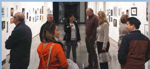
Attendees had the chance to check out student art from across Kansas, as well as the Mark Arts building.